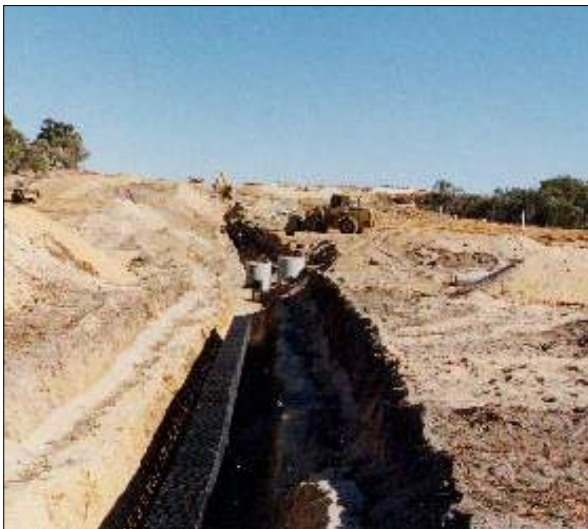
Backfilling of Atlantis Ecological Channels with permeable material.