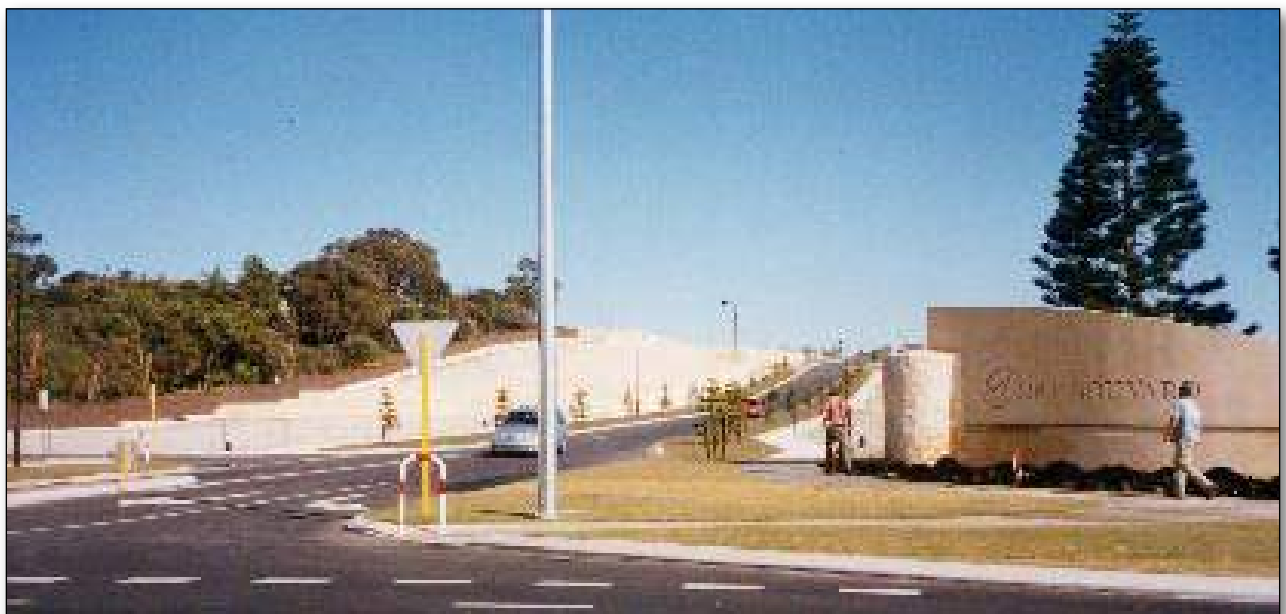
Entrance to the succesful complex using Atlantis Water Management System.

Port Bouvard in Western Australia has found a solution to develop this large area according to the requirements from the local government and EPA. They have adopted the environmental system developed by Atlantis.