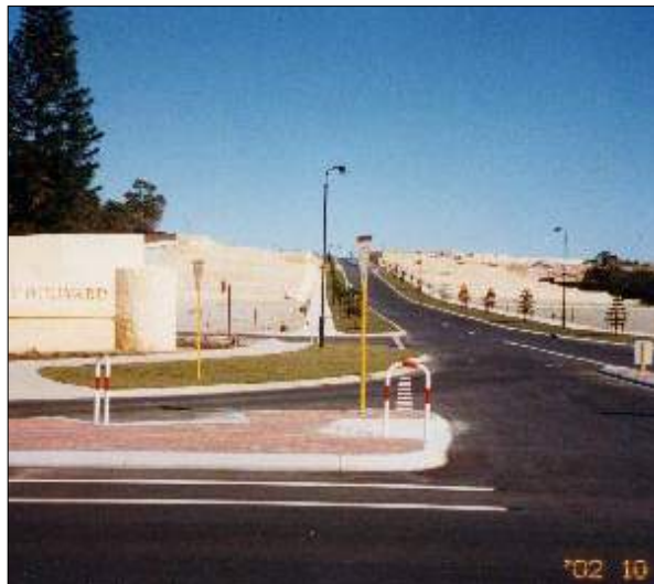
Job happily finished and ready for final development.