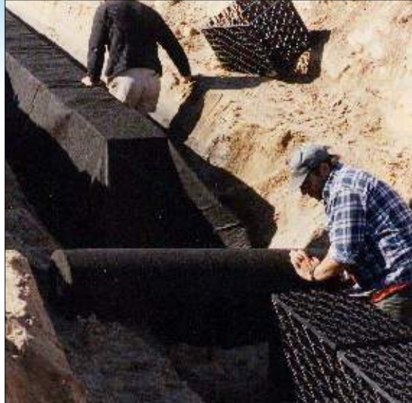
Covering Atlantis Ecological Tanks with Geotextile.