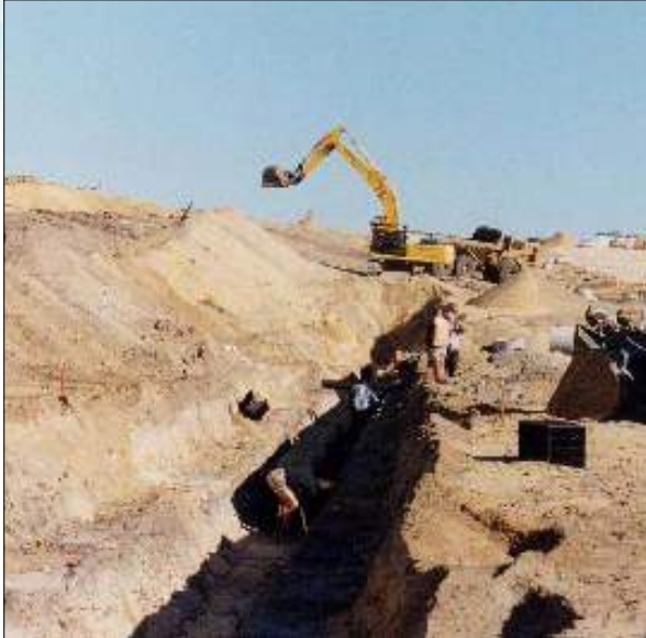
Excavation to install the Atlantis Ecological Tanks